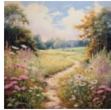
(2) Select and Upscale Image