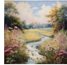
(5) Select and Upscale Image

The image was further modified by repeating the editing process: