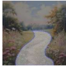
(3) Use Freehand Editing Tool to Select Region