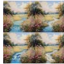
(4) Generate Candidate Images with Prompt: meadow stream lithograph