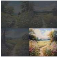
(1) Generate Candidate Images with Prompt: meadow trail lithograph

Many popular AI platforms offer tools that encourage users to select, edit, and adapt AI-generated content in an iterative fashion. Midjourney, for instance, offers what it calls “Vary Region and Remix Prompting,” which allow users to select and regenerate regions of an image with a modified prompt. In the “Getting Started” section of its website, Midjourney provides the following images to demonstrate how these tools work. 136